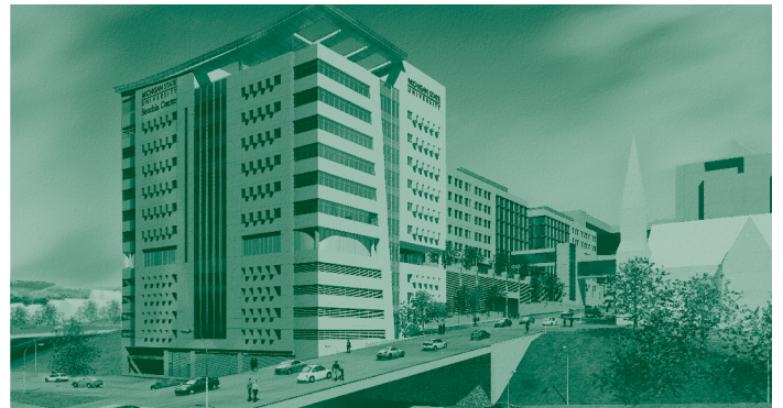
Artist's rendering of Secchia Center

The Harry A. and Margaret D. Towsley Foundation provides grants to programs that promote education, health care, shelter, and nutrition for children, with additional areas of concentration in college and university education, medical education, conservation, and interdisciplinary programs in law and social work.