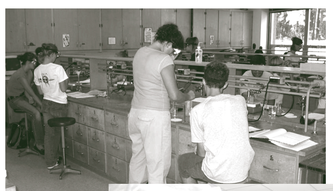
Lyman Briggs laboratories before renovation

The Lyman Briggs School opened in 1967 as a residential college with a math and science focus.