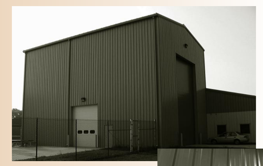
The high-bay Alton L. and Janice M. Granger Structures and Pavements Laboratory was specifically designed for testing materials used in the construction of roads, bridges and other massive structural components.

The new laboratory significantly enhances the College of Engineering's ability to recruit top structural engineering faculty and talented pools of graduate and undergraduate students. In addition, faculty will be able to serve the needs of industry. The new lab will operate within a flexible, cost-competitive framework for