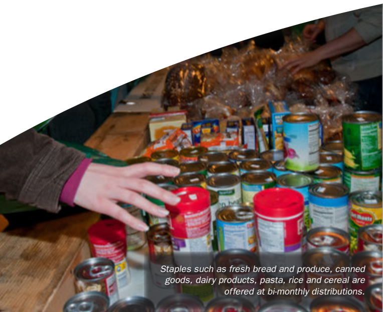
Staples such as fresh bread and produce, canned goods, dairy products, pasta, rice and cereal are offered at bi-monthly distributions.