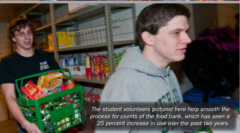
The student volunteers pictured here help smooth the process for clients of the food bank, which has seen a 25 percent increase in use over the past two years.