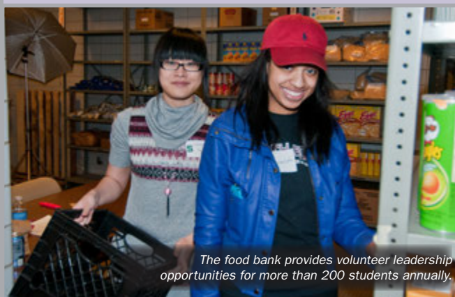
The food bank provides volunteer leadership opportunities for more than 200 students annually.