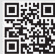
This icon is a QR code that allows smart phones to access additional content.