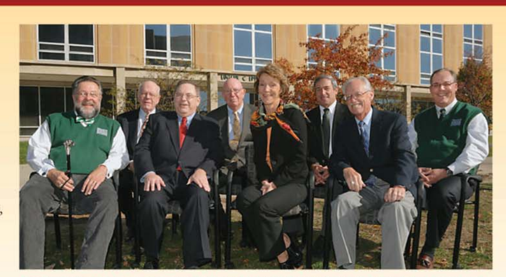
Eight faculty members were among those that named a chair in the soon-to-be-built demonstration theater, part of the Culinary Business Learning Lab revitalization project.