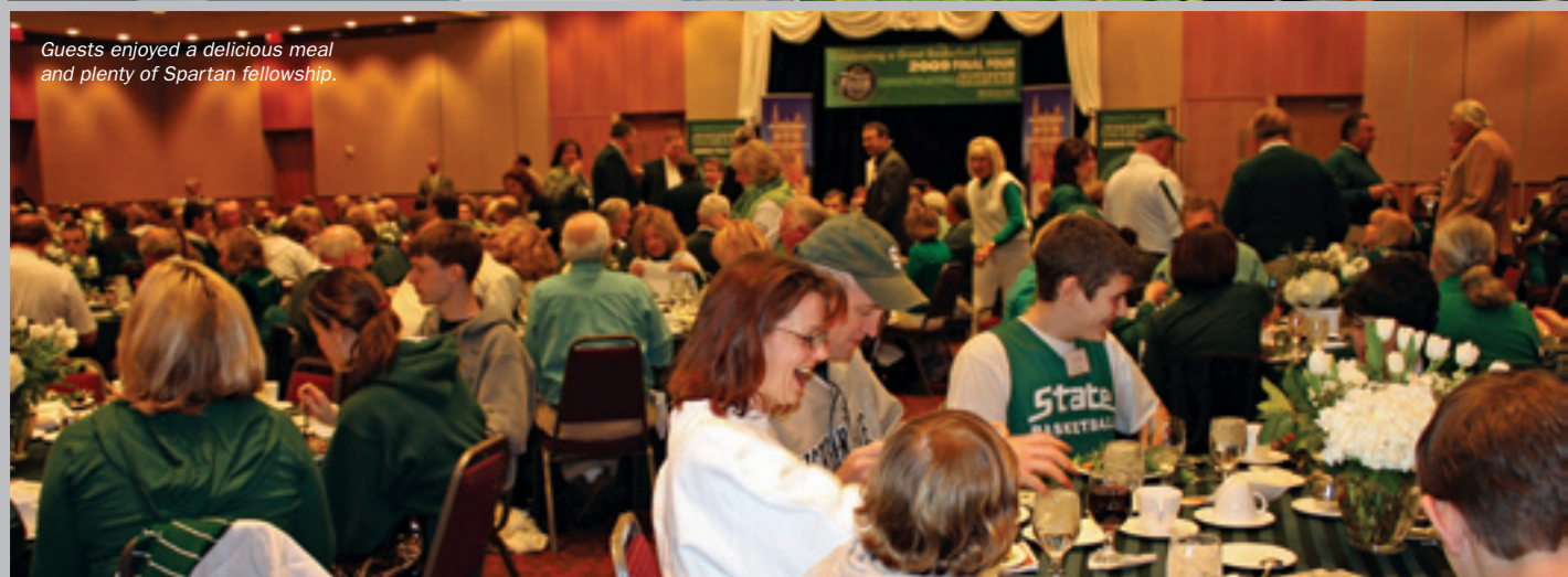
Guests enjoyed a delicious meal and plenty of Spartan fellowship.

NON-PROFIT ORG. US POSTAGE PAID E. LANSING, MI PERMIT #21