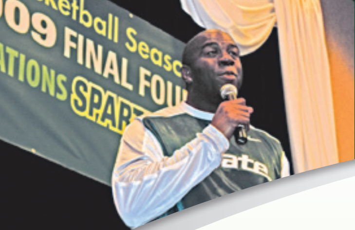
Earvin "Magic" Johnson celebrated with the crowd.