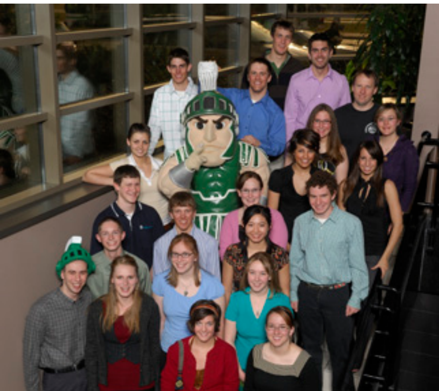
Some of the current STARR scholars posed with Sparty at their spring banquet.

Since 1998, the STARR Charitable Foundation Scholarship program has provided a one-of-a-kind opportunity for students residing in the state of Wyoming to attend Michigan State University for four years with all regular costs covered. To qualify for the scholarship, students must display academic achievement with at least a 3.0 grade point average; however, the demonstration of distinguished personal character and leadership ability is paramount.