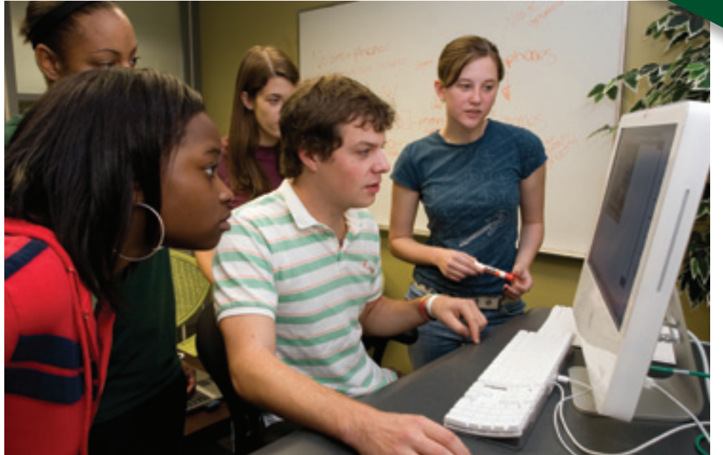
The donor, who wishes to remain anonymous, requested that $7 million of the gift be used for financial aid and scholarships to benefit MSU students.