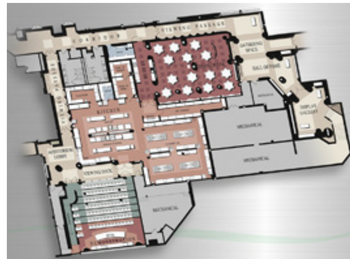
Artist rendering of the proposed Culinary Business Learning Lab.