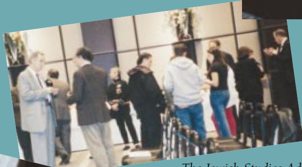
The Jewish Studies Advisory Committee reception.