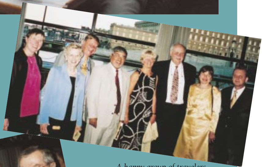
A happy group of travelers enjoy the trip to the Baltic.