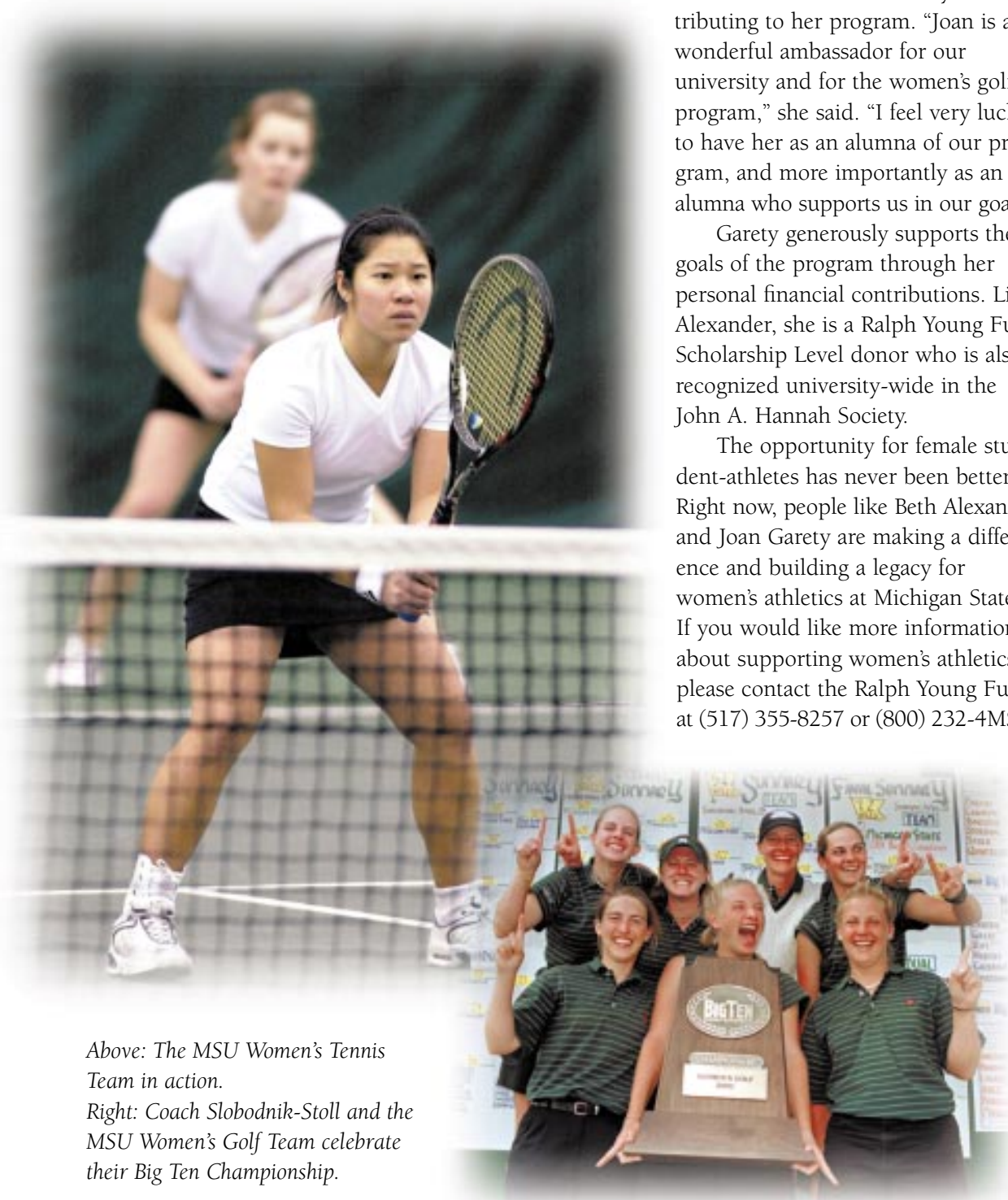
Above: The MSU Women's Tennis Team in action.

The scholarships will be awarded beginning in the 2001-02 academic year. The School, which marks its 75th year in 2001, has the nation's leading business-based curriculum in the hospitality industry.