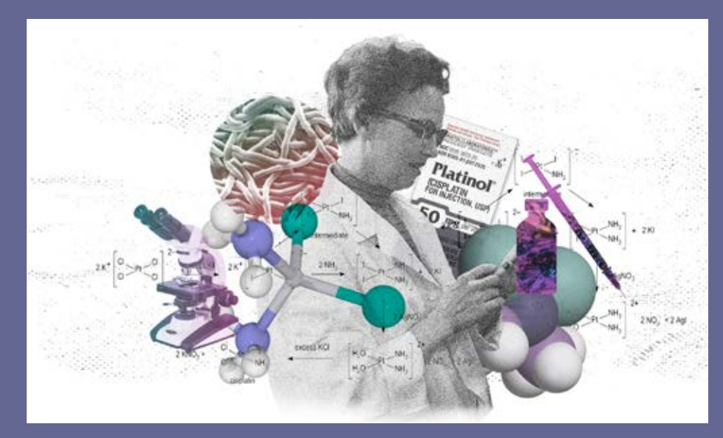
LEARN MORE at go.msu.edu/vancamp

"It knocks me off my feet, the quality of the people that are in charge now," says Tracy. "It is heartwarming and reassuring to see the growth in students and faculty participation. And I want to do what I can to help them raise the next generation of young people, who will be in charge in short order."